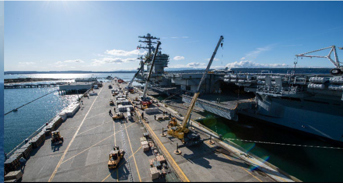
PSNS Dry Dock