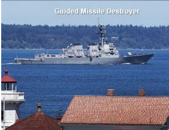
Guided Missile Destroyer