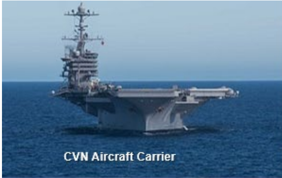
CVN Aircraft Carrier